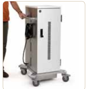
Moves easily on 4" casters.