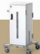
Mini-touch Charging Cart