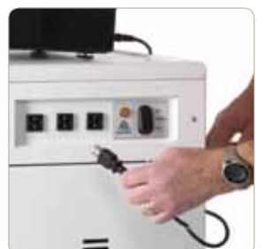
3 external power outlets.