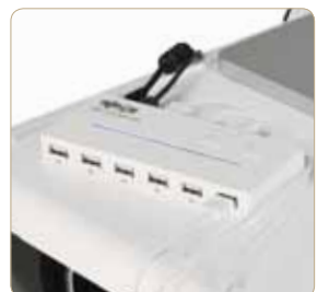
For a wired connection, use the USB Sync Kit.