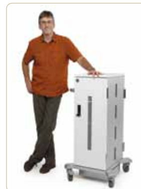
Small 2' x 2' footprint.