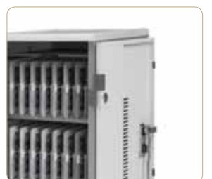
Doors open 270° to lay flat.