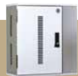
Tablet Charging Cabinet