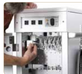
Separate locking IT area.