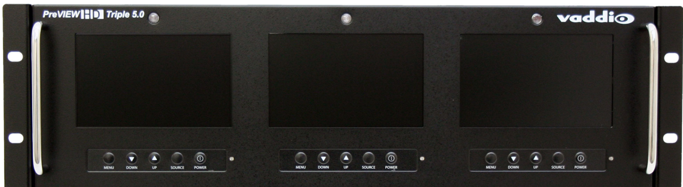
Figure 3: Front panel of PreVIEW HD Triple 5.0 LCD monitors