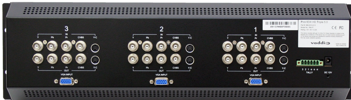
Figure 2: Back panel of PreVIEW HD Triple 5.0, showing the input, output, tally and power connections