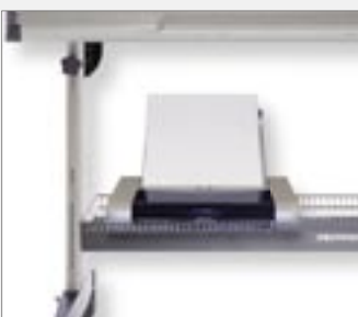
Battery and portable printer options