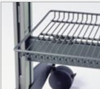
No-slide storage basket