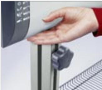
Effortless, one-person height adjustment