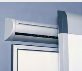
Power and Data Track *