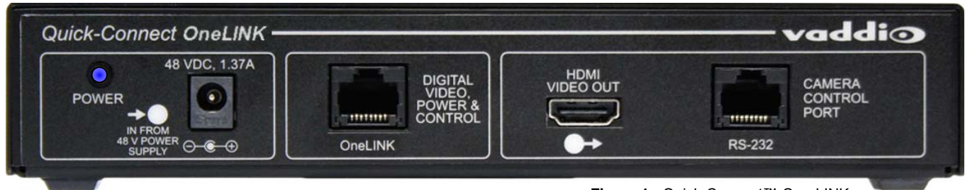
Figure 1: Quick-Connect™ OneLINK

Part Numbers: 999-9550-000 - North America, 999-9550-001 - International