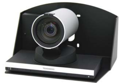
Figure 3: TANDBERG PrecisionHD 1080p Shown with mount with EZIM behind Camera (Camera and Codec Not Included)