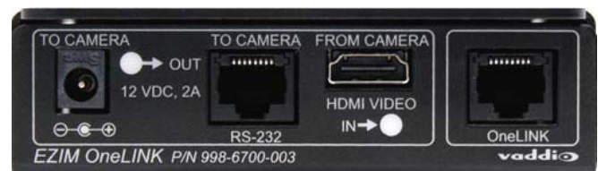
Figure 2: EZIM™ OneLINK High Speed EZ Interface Module (Placed out at the camera/mount)

The OneLINK system sends and regulates power to the camera, provides a bi-directional control channel for RS-232 and transmits/receives uncompressed HD digital video up to and including 1080p/60Hz, all on One (1) Cat-5e cable, hence the name, OneLINK. The OneLINK is a complete peripheral system and comes with the Quick-Connect, the EZIM, and three 1' (30.5cm) native cables at the camera (HDMI, 5.5mm OD x 2.1 mm ID power cable, and RJ-45 patch cable). We even go as far as including a totally awesome camera mount made specifically to mount the PrecisionHD series PTZ cameras and the EZIM.