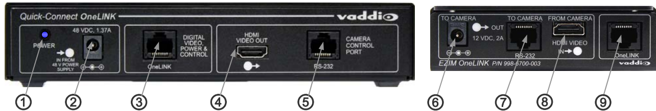
Figure 4: OneLINK Quick-Connect and EZIM connectors and functional callouts