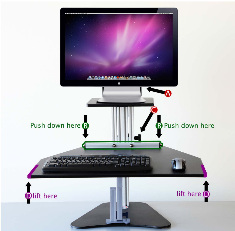
optimal location for support leg

Any questions about The MyMac Kangaroo Contact us at info@ergodesktop.com or 866-232-7988