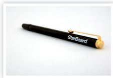
Stylus pen (included)