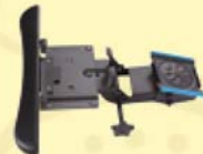
95520 Econo Keyboard Tray A low cost, high value tray which includes an articulating arm, keyboard clamp, and a palm rest. To see additional options please go to our website listed below.