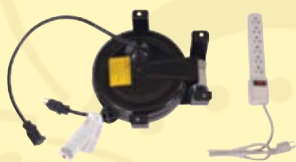
55403 Cord Reel Kit This kit contains a 15-amp cord reel and 6-outlet power strip making power access much easier