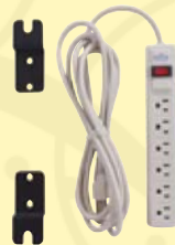
55404 Power Strip Kit This kit contains a 6-outlet power strip with 12' cord and 2 cord wraps