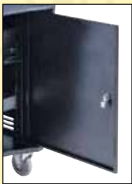
55405 Instructor-Side Locking Door Locking instructor-side door provides security