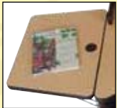
55402 Side Shelf mounts on left or right (max 2 per unit)