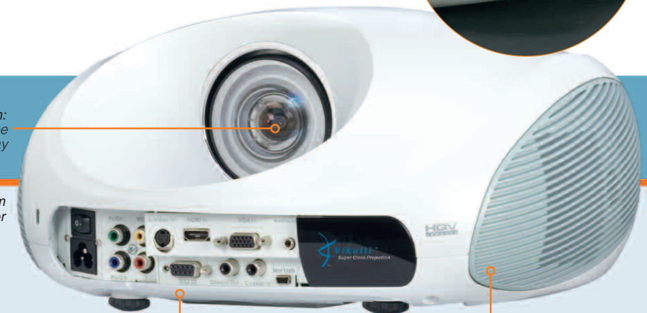
3M Digital Media System 710 Projector

Security Lock Bar (not available on all models): Allows you to secure the projector in the classroom or boardroom