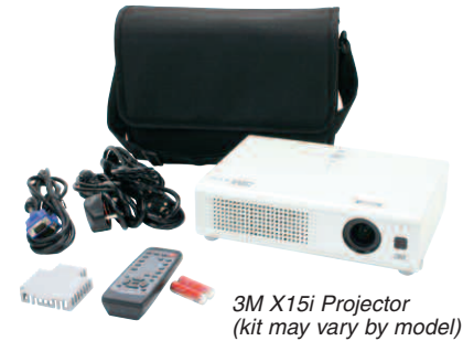
3M X15i Projector (kit may vary by model)