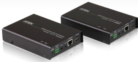
❑ VE814 / VE812 - HDBaseT HDMI Extender