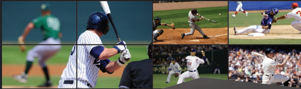
VM5808H 8x8 HDMI Matrix Switch