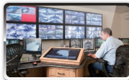
Traffic Control Center