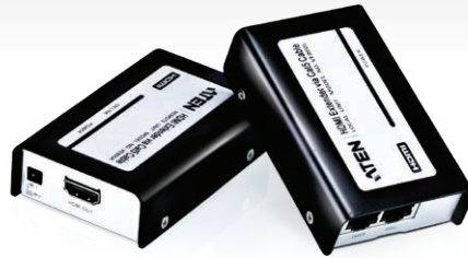
❑ VE800 / VE810 - Dual Cat5 HDMI Extender