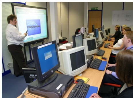
EQUIPPING NORTH WALES POLICE WITH THE BEST IN PRESENTATION SOLUTIONS

In a bid to streamline training and briefing programmes, North Wales Police Force has installed Hitachi Software Engineering's highly acclaimed interactive whiteboards across four of its training locations in North Wales. As part of a continuing drive to improve standards, the StarBoards – provided by Intergraph Public Safety (UK) Ltd and installed by Image Business Systems (UK) Ltd in January 2003 – were part of a total overhaul of existing IT systems in order to create a more efficient and smooth-running public service.