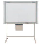
UB-7325 4-screen Standard size (shown with optional stand)