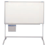
UB-5815 2-screen Wide size (shown with optional stand)