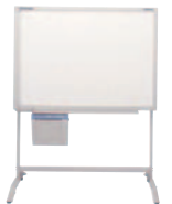
UB-5315 2-screen Standard size (shown with optional stand)