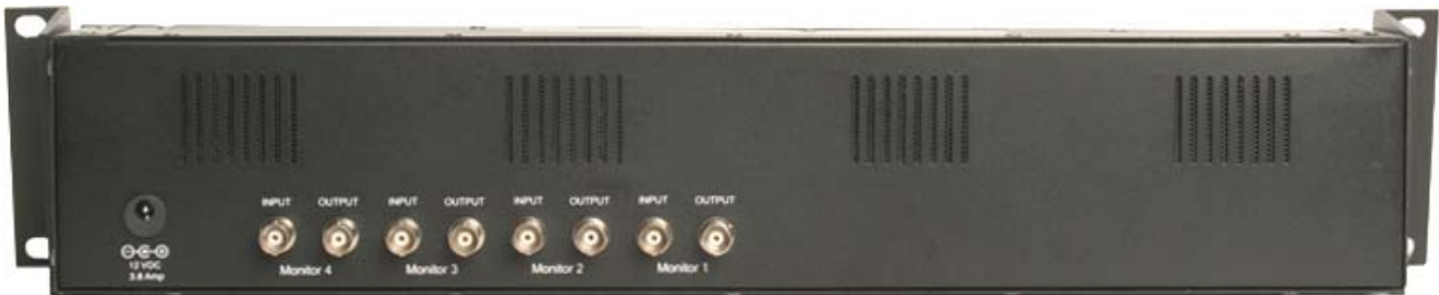
Figure 3: Back Panel of PreVIEW Quad 4 showing 2-BNC connectors (in & out) per LCD and power connector.